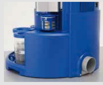
Connecting to exhaust air routing