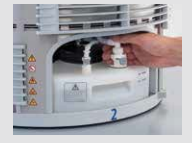
Connecting media containers