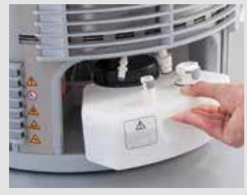
Installing media containers