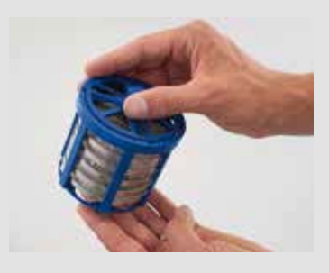
Removing cleaned and dried baskets