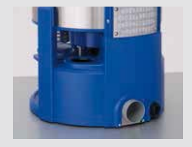
Connection to controlled exhaust air routing