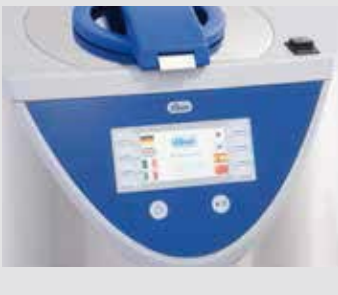
Selecting and starting program