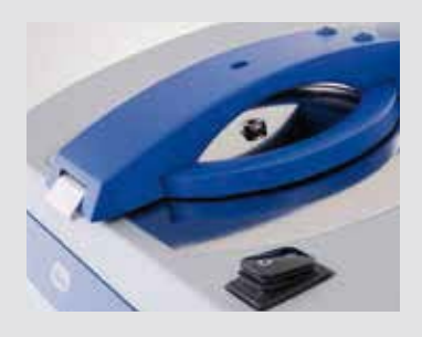
Vacuum is established