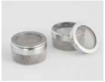
Elmasolvex® RM with wide