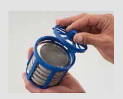
Filling baskets with watch parts

Elmasolvex VA has its own self-contained intrinsic Ex-protection due to the vacuum technology used and all the measures required by TÜV and the applicable technical regulations for explosion safety. This means that the explosion protection measures integrated in the machine already rule out any fire hazard in the primary zone, operation in compliance with the manual provided. The use of ultrasound is thus legally possible and permitted. The TÜV test performed confirms the requirements for the use of the prescribed CE mark.