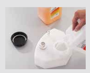
Filling cleaning and rinsing solution