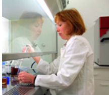
Basic Research / Research Institutes